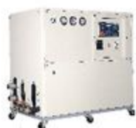
水冷式冰水機 Water Chiller