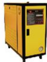
模溫機 Mould Temperature Controller