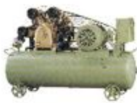
空氣壓縮機 Air Compressor