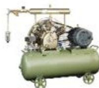
增壓機 Air Booster