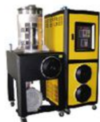
三機一體除溼乾燥機 Three in one dehumidifier