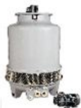
散熱水塔 Cooling Tower