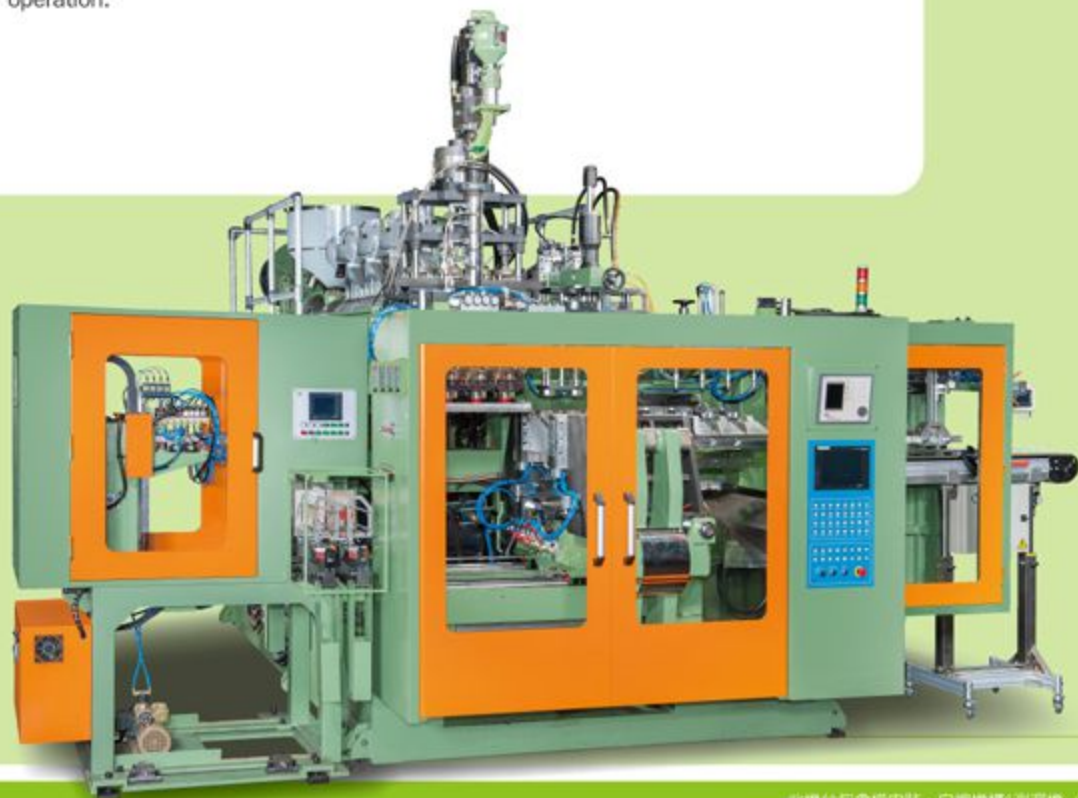
此機台包含模內貼、白線機構及測漏機 (選配) Machine with IML, visistripe, and leak tester (optional)